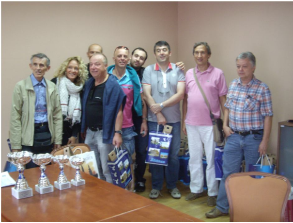
5th place – Team PORDENONE (ITALY)