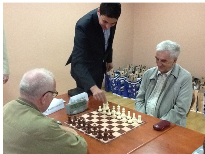
Opening ceremony - first move by The President Of Zagreb City Assembly