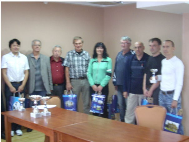
3rd place – Team CELJE ŠENTJUR (SLOVENIA)