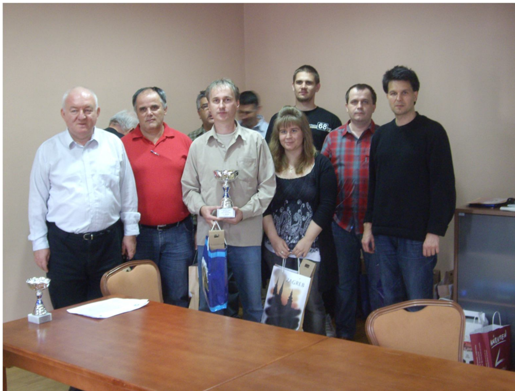
1st place - 25th Chess Tournament Of The Five Cities "Alps-Danube-Adriatic" winners BALATONALMADI (HUNGARY)