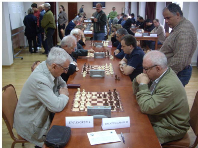
Round 1: ENT Zagreb I vs. Balatonalmadi II