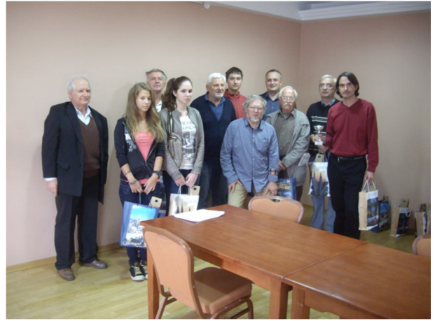
4th place – Team ENT ZAGREB (CROATIA)