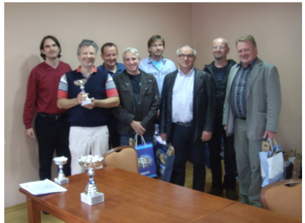
2nd place - Team WOLFSBERG (AUSTRIA)