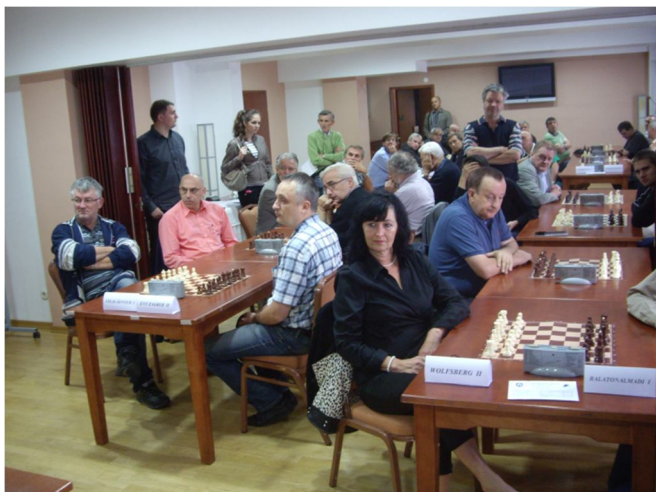
25th Chess Tournament "Alps-Danube-Adriatic" can start!